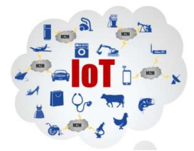
Figure 2: How things connected with M2M with IOT

Although the Internet of Things and machine-to-machine communications have remote device access in common, that's about where the similarities end. Learn how to specify the right solution for your needs. Once a trend, the Internet of Things has become a reality that is changing the world in which we live. However, buzzwords can sometimes lead to confusion and cause questions to arise. So, are IoT and M2M the same thing? What is the difference between them? Interestingly enough, this same question has spurred a discussion on Quora, and has been tackled by professionals within the industry. Some use both terms interchangeably, whereas others are adamant that they are not to be confused. First of all, we can be certain that these two concepts do indeed have different meanings. Most conclude that Internet of Things is a broader concept, which will evolve from M2M and other technologies. Simply put, Machine-to-Machine is where "Machines" use network resources to communicate with remote application infrastructure for the purposes of monitoring and control, either of the "machine" itself, or the surrounding environment. The potential interconnection of smart objects and the way we interact with the environment is what The Internet of Things is envisioned to be, where the physical world will merge with the digital world.