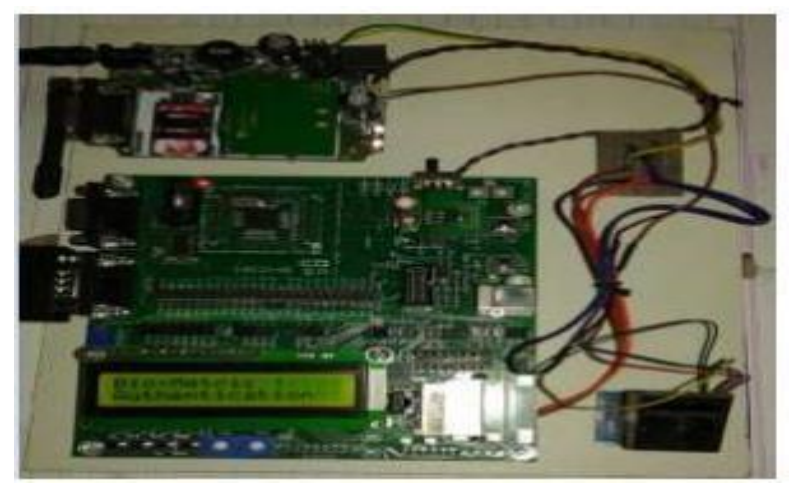
Fig.2. Hardware Implementation

The Criminals whose arrest warrant are issued and face recognition biometric is directly connected to the police crime branch. The software matches his face with the criminals. If the face is matched, then send message to the police control room. If the person is not a criminal then he can be able to access their bank locker. For that he should put his hand on hand geometry scanner which is based on multi-spectrum technology and is able to work in all conditions/environment like dry, wet, dirty, elderly, high ambient light etc.