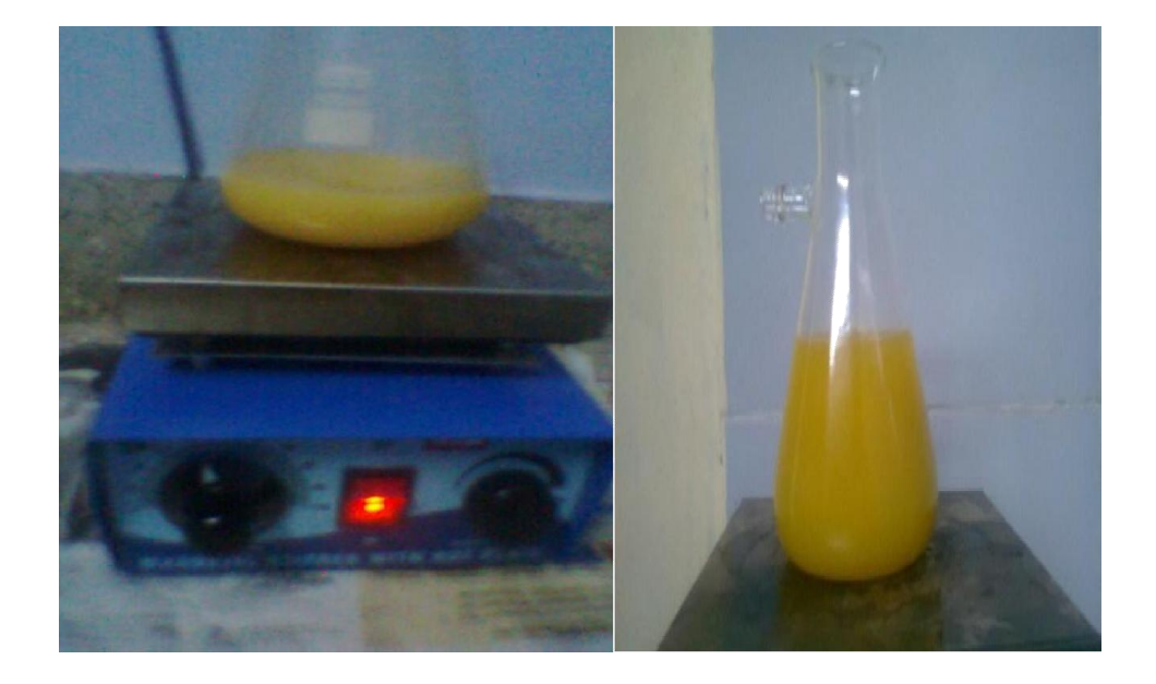
Fig .2 .heating of rice bran oil