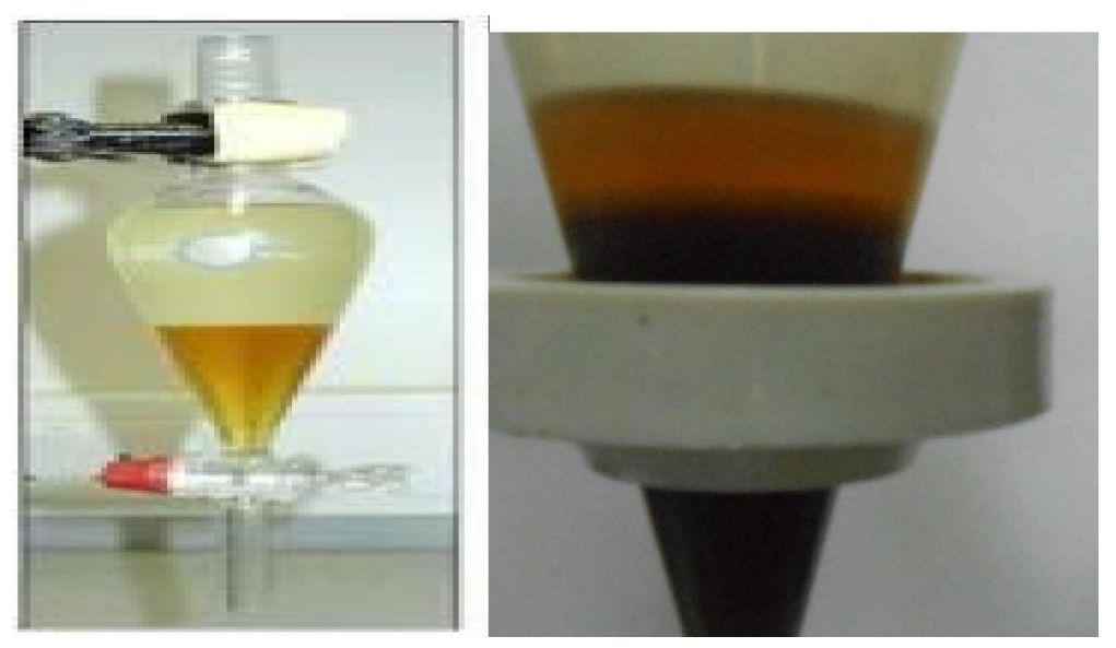
Fig 3 Separation of biodiesel from glycerol