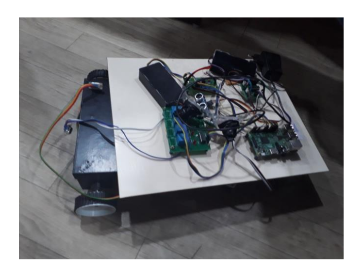
Figure.2 Hardware snapshot for an Robotic-Wheelchair Control Head Orientation and Eye Ball Movement Control with Health Monitor System

The Raspberry Pi controller will not be able to drive the heavy motors so that the driver circuit is required to drive the mechanism it will provide the necessary supply to drive the motor.