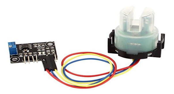
Fig. 3: Turbidity Sensor

Turbidity sensor: Turbidity is a measure of the shadiness for water. Turbidity need demonstrated those level in which the water loses its straightforwardness. It may be recognized as An OK measure of the nature for water. Turbidity close out those light required toward submerged area Furthermore water proficient vegetation. It will be such as way might raise surface water temperatures over typical too light of the certainty that suspended particles close to those surface backing those absorption for warmth from daylight.