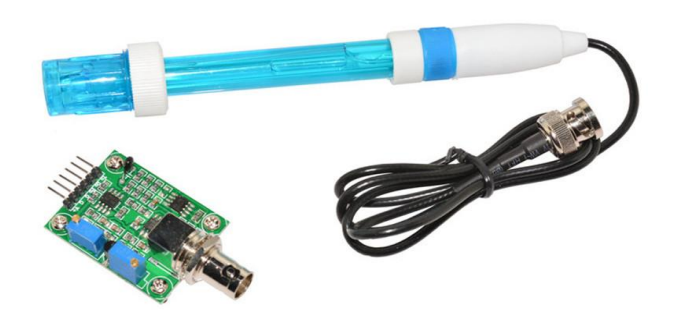
Fig. 2: pH sensor

point being 7. Qualities over 7 show a fundamental or basic arrangement and qualities underneath 7 would demonstrate an acidic arrangement. It works on 5V control supply and it is anything but difficult to interface with arduino. The typical scope of pH is 6 to 8.5.