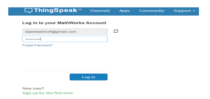
Fig. 8: Data Logging on ThingSpeak

To show the nature of water, the pH sensor and EC sensor is put into a holder loaded with tap water, to which 34 drops of corrosive is included. From the diagrams in Fig. 4 demonstrated as follows, we can see that the pH of the water stays at around 3 to 4.5 means the water is acidic in nature. The temperature of the encompassing remains between 32 to 34 degrees. The turbidity of water is at 3.5 to 4 NTU.