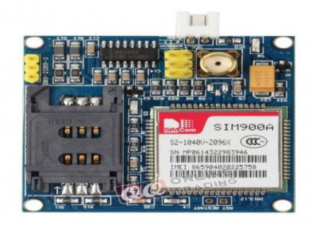
Fig. 6: GSM (SIM 900A) Module

GSM module: GPRS stays for Worldwide Bundle Radio Administration is a development of GSM that engages higher data transmission rate. GPRS module include a GPRS modem assembled with control supply circuit and correspondence interface (like RS232, USB et cetera.) for PC organize.