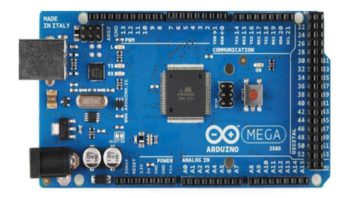
Fig. 4: Arduino Mega 2650

Arduino modifying (IDE) were those reference renditions about Arduino, Right away propelled with fresher discharges. Those Uno board may be those initial clinched alongside An progression from claiming USB Arduino sheets, and the reference exhibit to those Arduino stage; to an expansive rundown about present, previous alternately outdated sheets see the Arduino rundown of sheets.