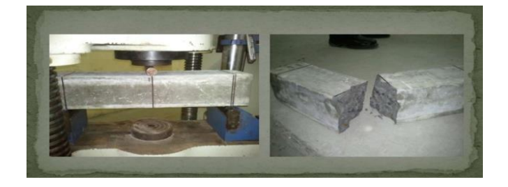
FIGURE 4: Flexural strength of beams