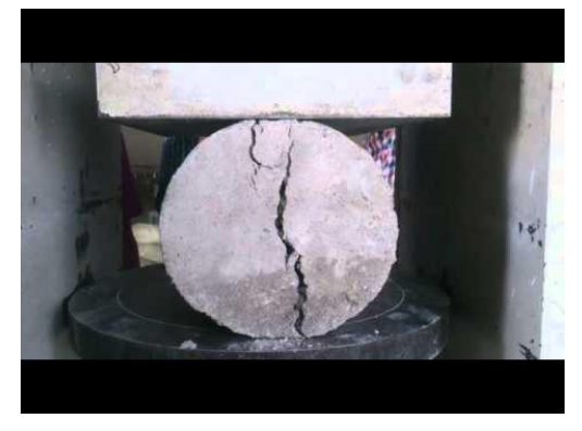
FIGURE 2: Split tensile test

The test is carried out on cylindrical specimens using a bearing strip of 3 mm plywood that is free of imperfections and is about 25 mm wide.